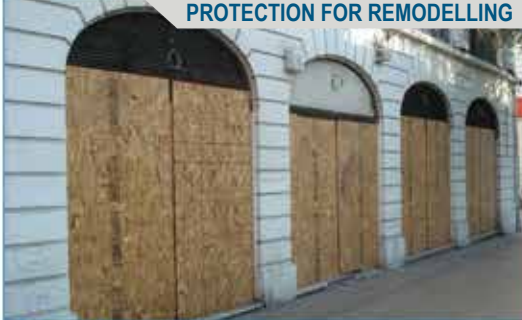
PROTECTION FOR REMODELLING