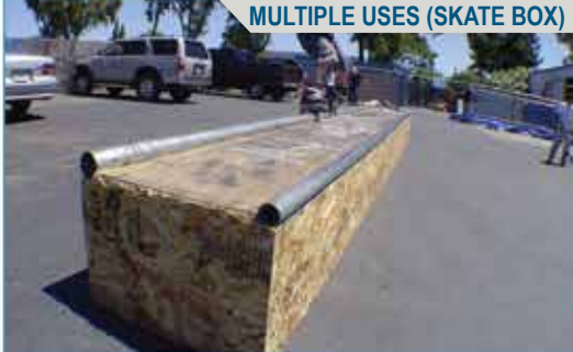
MULTIPLE USES (SKATE BOX)