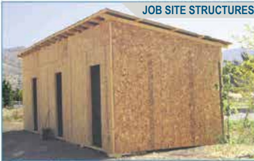
JOB SITE STRUCTURES

Far from being just a panel, this panel is an inexpensive and fast solution for all type of temporary uses.